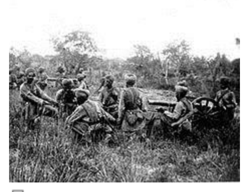
Indian soldiers in 1947 war.

Nehru's foreign policy was the inspiration of the Non-Aligned Movement, of which India was a co-founder. Nehru maintained friendly relations with both the United States and the Soviet Union, and encouraged the People's Republic of China to join the global community of nations. In 1956, when the Suez Canal Company was seized by the Egyptian government, an international conference voted 18-4 to take action against Egypt. India was one of the four backers of Egypt, along with Indonesia, Sri Lanka, and the USSR. India had opposed the partition of Palestine and the 1956 invasion of the Sinai by Israel, Britain and France, but did not citation needed oppose the Chinese direct control over Tibet and the suppression of a prodemocracy movement in Hungary by the Soviet Union. Although Nehru disavowed nuclear ambitions for India, Canada and France aided India in the development of nuclear power stations for electricity. India also negotiated an agreement in 1960 with Pakistan on the just use of the waters of seven rivers shared by the countries. Nehru had visited Pakistan in 1953, but owing to political turmoil in Pakistan, no headway was made on the Kashmir dispute.