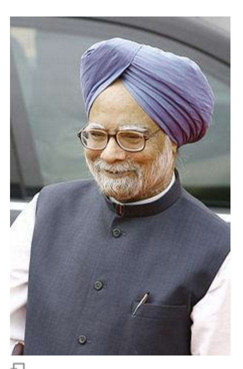
Manmohan Singh widely credited for initiating economic reforms in India.

Under the <u>policies</u> initiated by Late Prime Minister <u>Narasimha Rao</u> and his Finance minister <u>Manmohan Singh</u>, India's economy expanded rapidly. The Rao administration initiated the <u>privatization</u> of large, inefficient, and loss-inducing government corporations. The UF government had attempted a progressive budget that encouraged reforms, but the <u>1997 Asian financial crisis</u> and political instability created economic stagnation. The Vajpayee administration continued with privatization, reduction of taxes, a sound <u>fiscal policy</u> aimed at reducing deficits and debts, and increased initiatives for public works. Cities like <u>Bangalore</u>, <u>Hyderabad</u>, <u>Pune</u> and <u>Ahmedabad</u> have risen in prominence and economic importance, becoming centres of rising industries and destination for foreign investment and firms. Strategies like forming Special Economic Zones - tax amenities, good communications infrastructure, low regulation - to encourage industries has paid off in many parts of the country.